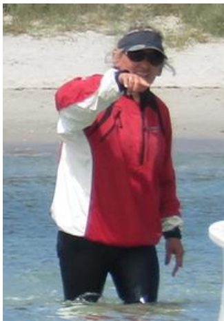
Mim Social Committee

Looking forward to seeing you all at our beautiful beach.